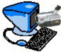
DREAM Collection & Web 2.0 tools