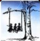
EDU4DRR Teachers Network