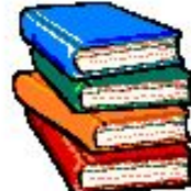
DP IN FORMAL CURRICULUM