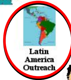
Latin America Outreach