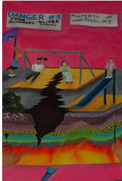
Student disaster reduction awareness campaign banner

International Strategy for Disaster Reduction Thematic Platform for Knowledge and Education