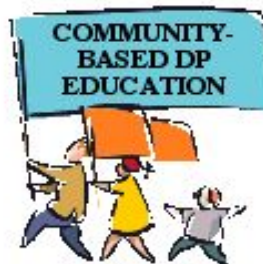
COMMUNITY- BASED DP EDUCATION