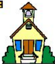
SAFE SCHOOL INFRASTRUCTURE