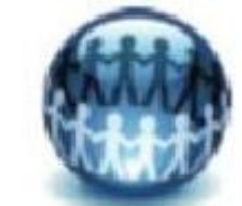
Global Coalition of Civil Society Organisations for Disaster Reduction