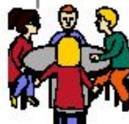
SCHOOL DISASTER MANAGEMENT