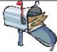
COGSS DPE Newsletter / Listserv