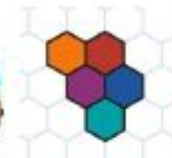
Global Platform 2009 HFA#3