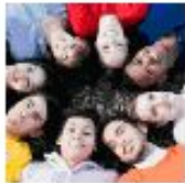
Capacity Building & Leadership Development