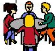
SCHOOL DISASTER MANAGEMENT