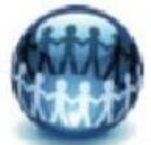
Global Coalition of Civil Society Organisations for Disaster Reduction