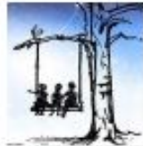
EDU4DRR Teachers Network