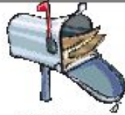
COGSS DPE Newsletter / Listserv