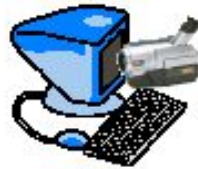
DREAM Collection & Web 2.0 tools