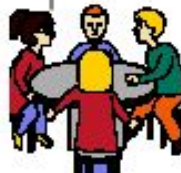
SCHOOL DISASTER MANAGEMENT