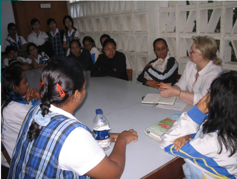
Focus group, Mauritius (Aug. 2007)